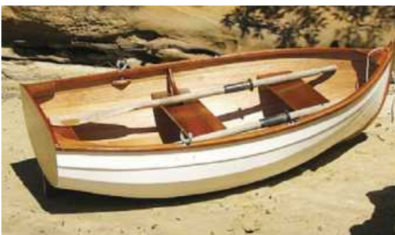
Auklet shows her surprisingly pretty lines.