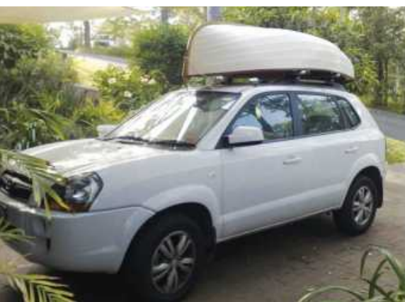
And on the roof of the car; she really IS small!