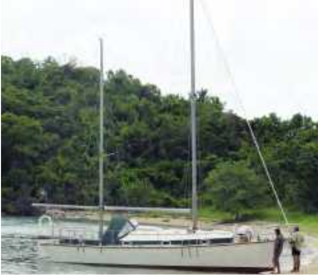
A big ocean capable boat with the beachability of a dinghy.

The unstayed cat ketch rig has achieved world wide respect in both cruising and racing on the smaller boats and the option will add to the already strong following for the 31.