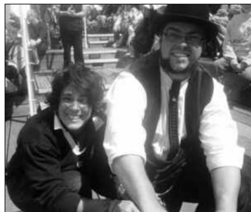
Soren Larsen crew and the guildsman from Germany.