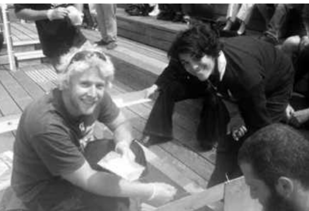
The builders did an amazing job of keeping the crowd mesmerised for the two hours of construction!