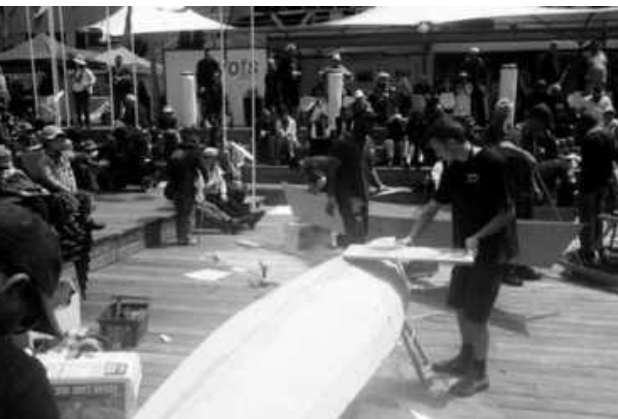
Sydney Heritage fleet work on their race winning boat.