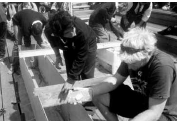
The Soren Larsen crew, notice the proa configuration.